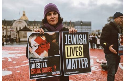
Fighting Antisemitism in France

In Paris, Nunez said, there will be 'zero tolerance' for any unrest before and after the match. 'We will not tolerate excesses or disturbances to public order,' he said, reiterating that checks at the entrance to the stadium will be 'extremely reinforced.'