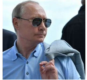
Russia President Vladimir Putin

He alleged that the United States often selected both the targets for Ukraine to attack and the means to attack them. "This is also often dictated from across the ocean. We know this well and are aware of this...in Washington they must clearly understand that we know this..."