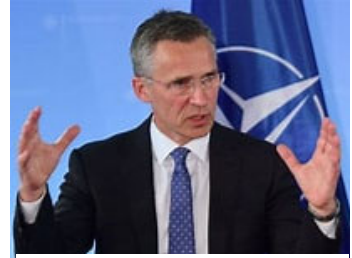
NATO Chief Jens Stoltenberg

NATO is due to launch the largest revamp of its defence and deterrence capabilities since the end of the Cold War by strengthening the forces on its eastern flank and massively ramping up the number of troops it has at high readiness..."