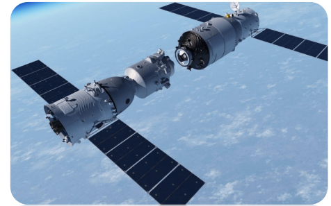
Chinese Tianhe Module

This mission is China's first manned space flight in five years, and the third of 11 needed to add more elements to the space station before it becomes fully operational next year. The new station is expected to remain operational for 10 years..."