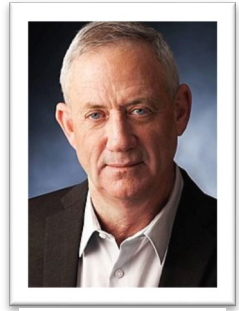
Defense Minister Benny Gantz

"Nobody can tell me that today's NATO is a structure that, in its foundations, is still pertinent. It was founded to face down the Warsaw Pact. There is no more a Warsaw Pact," he said." ..."