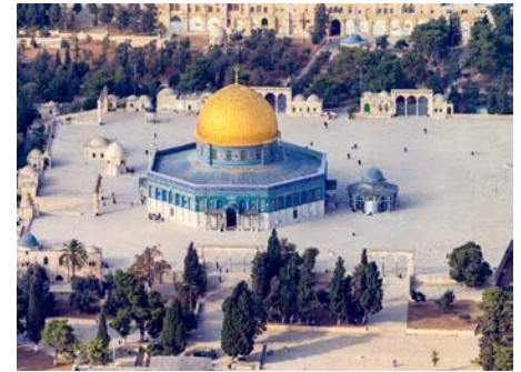
Jerusalem Temple Mount

‘The Israeli police will not allow violations of public order in the Temple Mount area, and will work to prevent any riots or calls of a nationalistic background,’ the Israel Police said...”