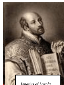
Ignatius of Loyola

While most Jesuits avoid clashes with the Vatican hierarchy, previous popes, including John Paul II, have taken issue with the autonomy the order appears to enjoy.”...”