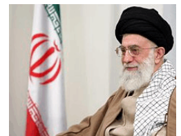
Ayatollah Ali Khamenei

Supreme leader Ayatollah Ali Khamenei, who this week congratulated Ahmadinejad for his role in Iran's nuclear case, said that Islamic countries do not need US approval to achieve great works."..."